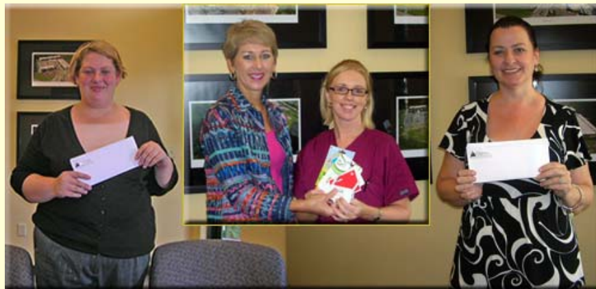
3 of our 10 winners that collected $50 gift packs from Alafaya Village.